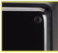
Tamper resistant hardware