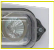
Max 50W MR16 lamps