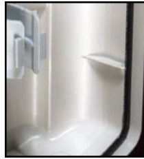
Liquid silicone perimeter gasket housing