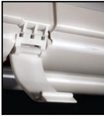
Flush mounted capture clip