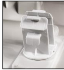
Tool-less access to the ballast housing