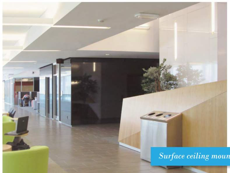
Surface ceiling mount