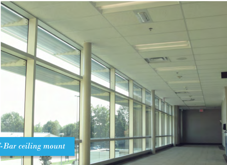
T-Bar ceiling mount

THE TEMPESTA™ boasts unique Italian design, reliability and increased fixture to fixture performance. The use of LED or fluorescent technology allows for an improved spread of light, fewer units to install and maintain lower energy consumption and creates a safer environment during a power failure. Designed for wall or ceiling installations, the Tempesta™ is suitable for any application.